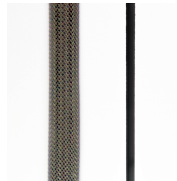
Typical HDMI cable

Bandwidth and data speeds at 16Gbps and beyond support high-resolution images and overcome the limitations of copper cable which can adversely affect HDMI handshake in long distance runs. Celerity Fiber optic HDMI cables may be installed in concealed locations, conduit, plenum spaces and cabling raceways.